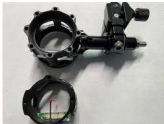
Shrewd 42mm Nomad and 40mm Optum