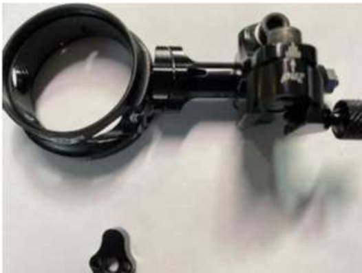
Shrewd 40mm Optum

They will not work with the standard supplied 10/32 x 2" threaded bolt as it is too short. A 10/32 x 2.5" bolt will be necessary to be able to get a locking nut on the distal end.