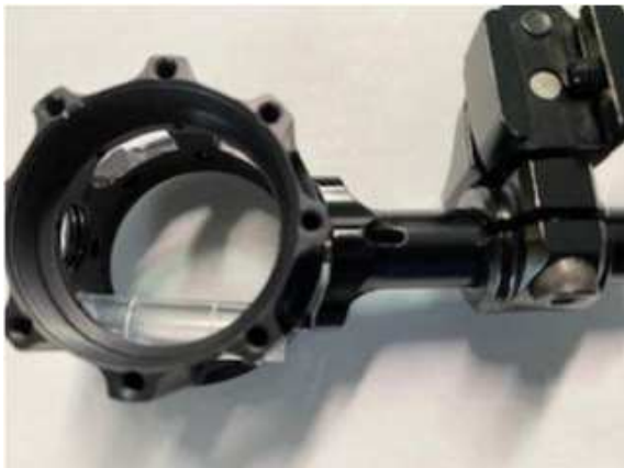
Shrewd 42mm Nomad

Shrewd Optum ( 40mm & 35mm) and Shrewd 42mm scope (not the 35mm, 29mm Nomad or Essential) will work with using the bare shaft and no adaptors, but this is not recommended as the curvature of the Sure-Loc rod is the only thing that is keeping the scope from rotating.