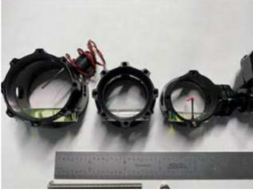
42mm & 29mm Shrewd Nomad, 29mm Shrewd Essential

They will not work with the standard supplied 10/32 x 2" threaded bolt as it is too short. A 10/32 x 2.5" bolt will be necessary to be able to get a locking nut on the distal end.