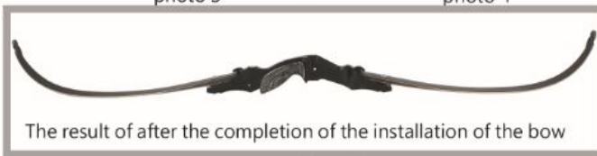
The result of after the completion of the installation of the bow