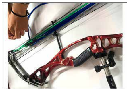
NR.2 CABLE SETTING