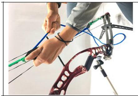
NR.4 PULLING CABLE (BLUE)