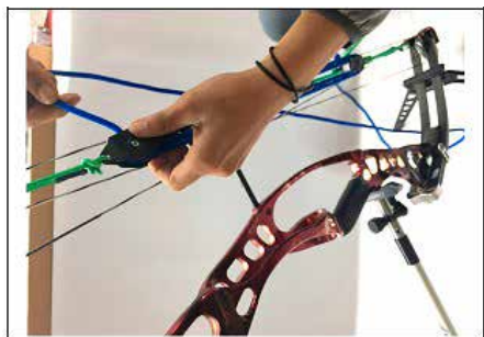
NR.5 PULLING BACK (BLUE)