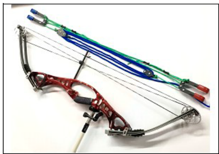
NR.1 PLACING (BLU MUST BE UPSIDE)