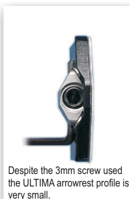
Despite the 3mm screw used the ULTIMA arrowrest profile is very small.

By placing the adjustment screw between the magnets, Shibuya was able to maintain a super-slim construction (only 3.8mm including adhesive tape), while at the same time using a 3mm screw for comfortable, safe adjustments.